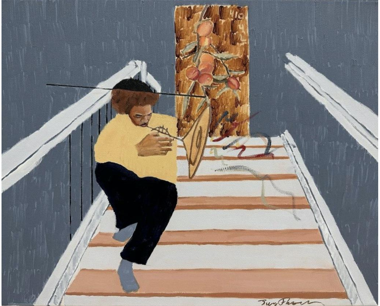
BLUES AND BLUE UPDATE 2023 SOLD