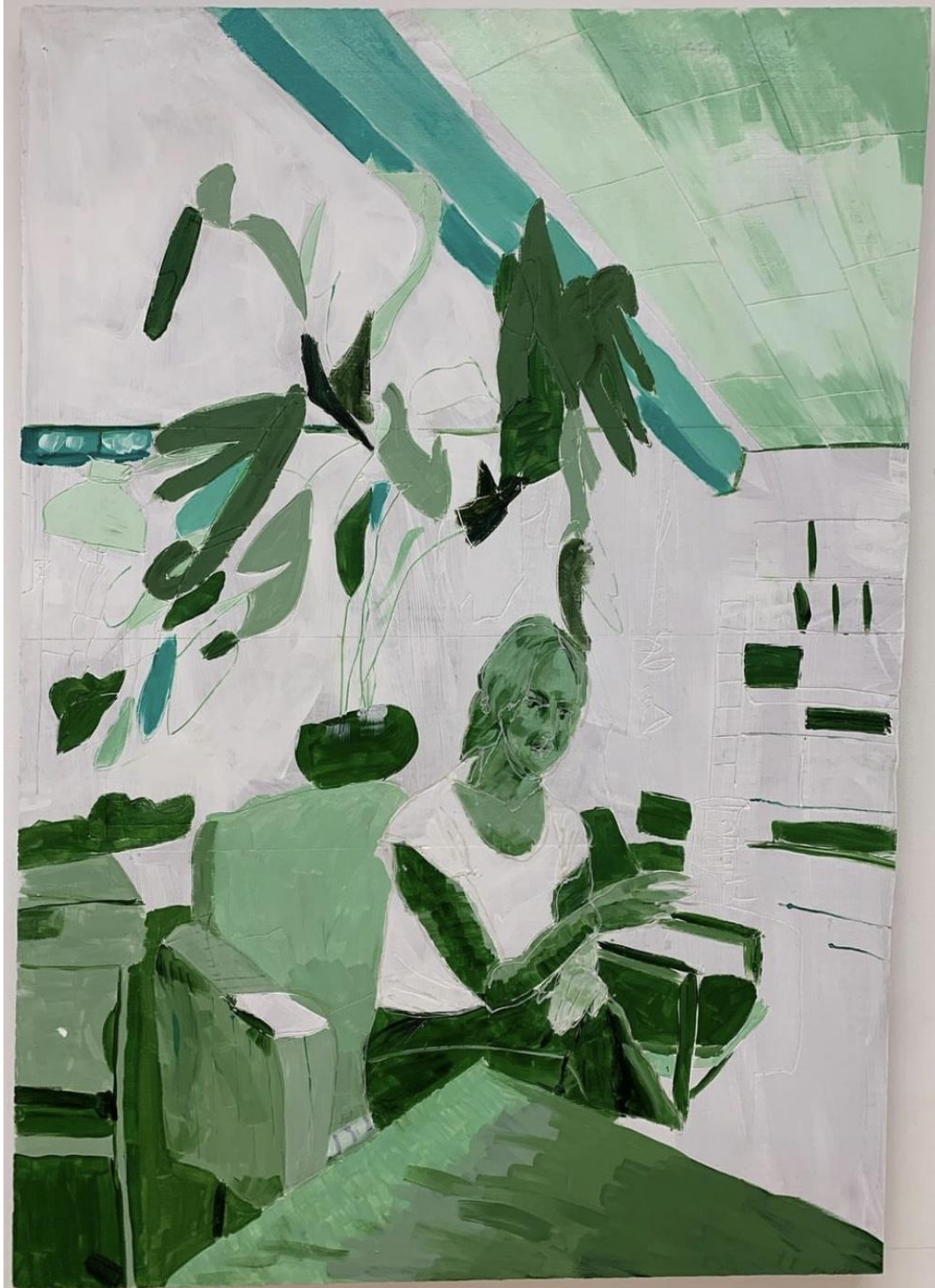
BEDSTEMOR & AIS HOUSE 2022

Acrylic, etching, and carbon fiber filament on styrofoam 33" x 48"