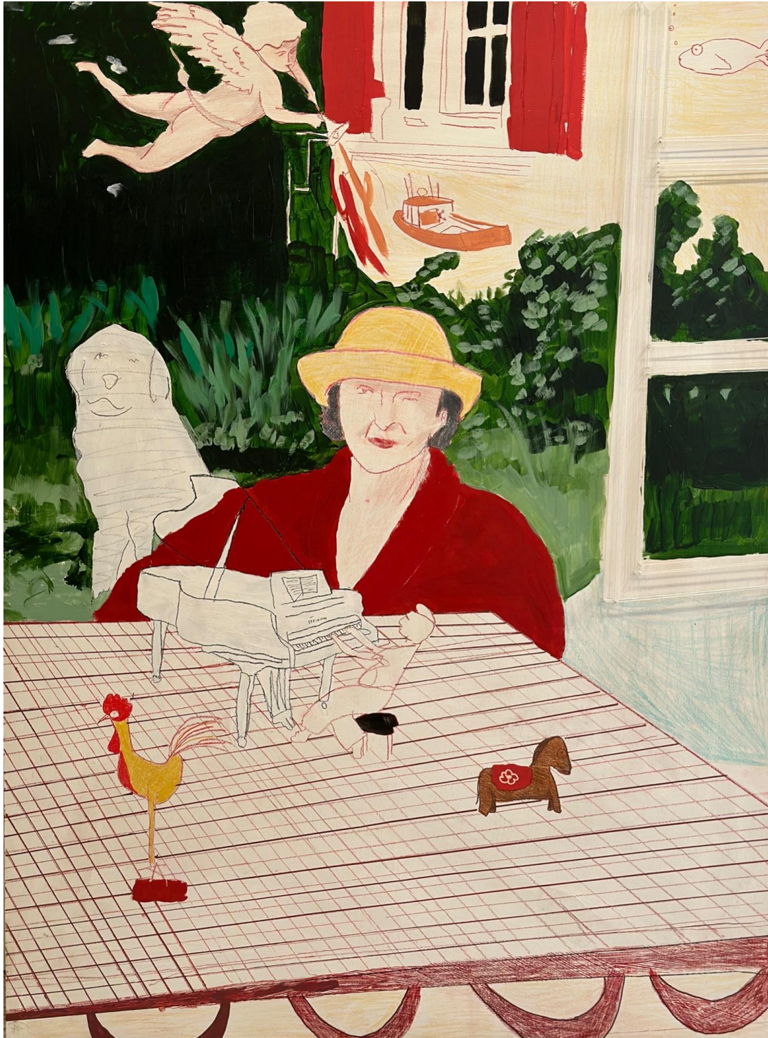
RED ROBE / RYDAL 2022

Colored pencil, acrylic, nails and thread on wood 30" x 40"