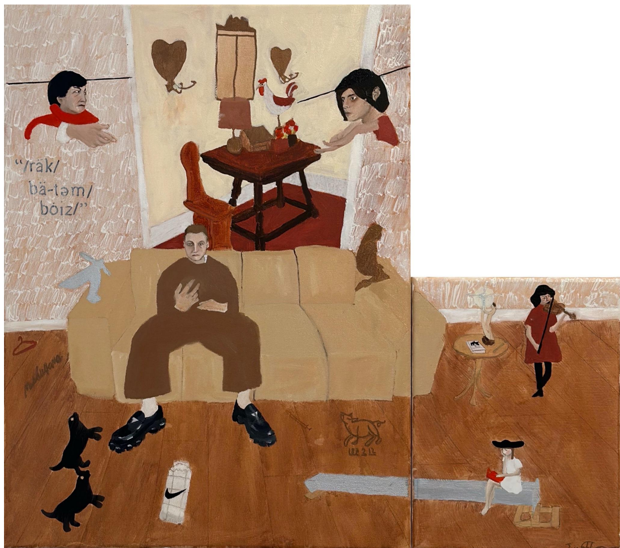
SELF PORTRAIT 2023 Oil on canvas 27" x 24"