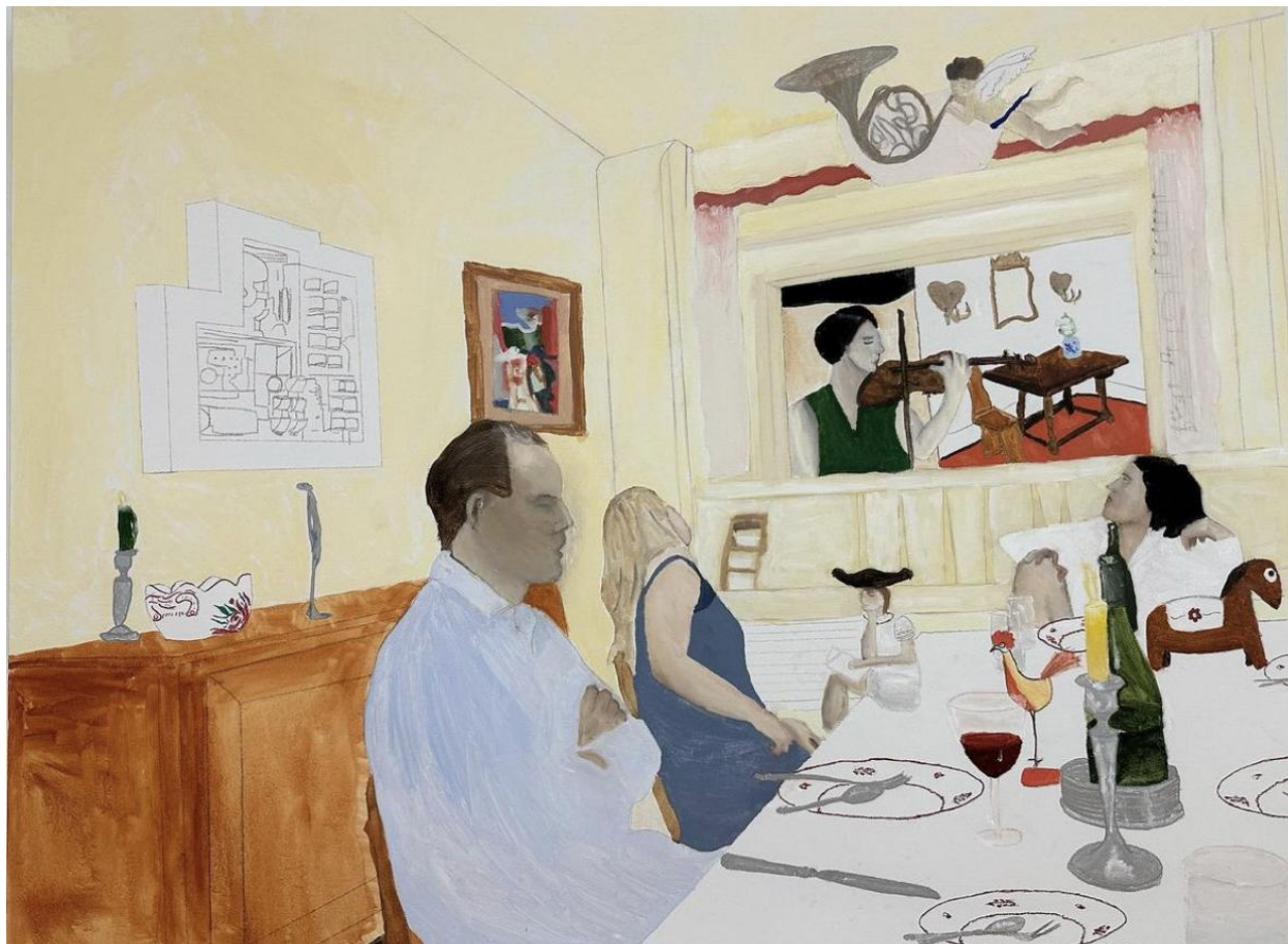
DINING ROOM SHOW 2022

Oil and colored pencil on canvas 36" x 48"