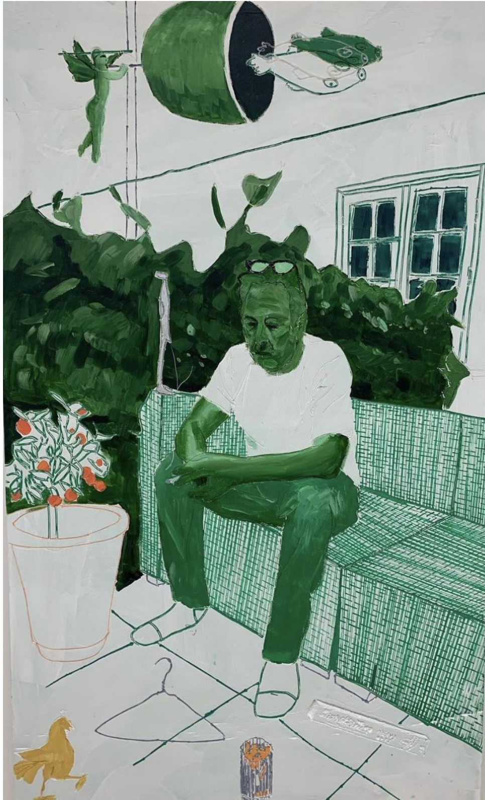
TOM FRIEDMAN LOOKING DOWN 2022

Acrylic, etching, and carbon fiber filament on styrofoam 24.25" x 48"