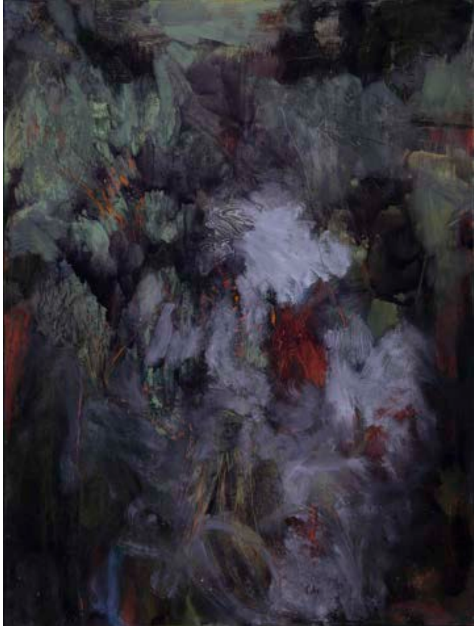
JUST A WHISPER 2026 Oil on panel 16" x 12"