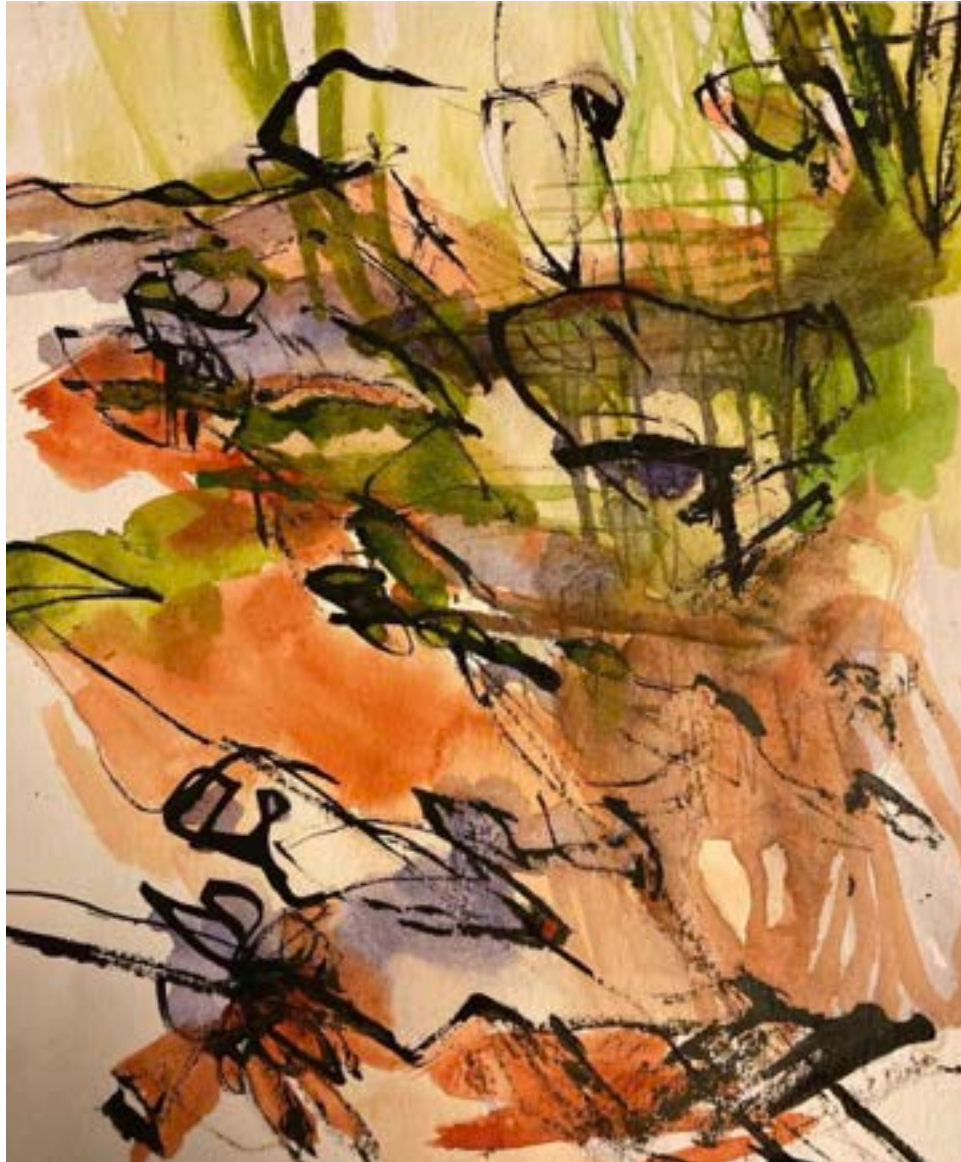
KENDUSKEAG STREAM STUDY 1 2022 Gouache and ink on paper 10" x 7"