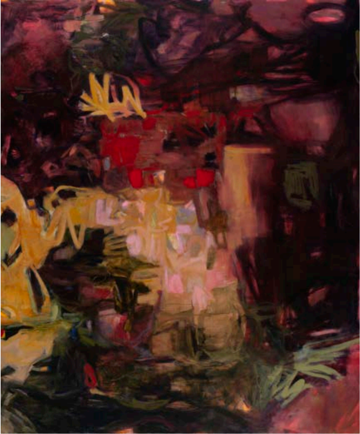
UPSTAIRS BY THE CHINA LAMP 2023 Oil on canvas 72" x 60" x 1.8"