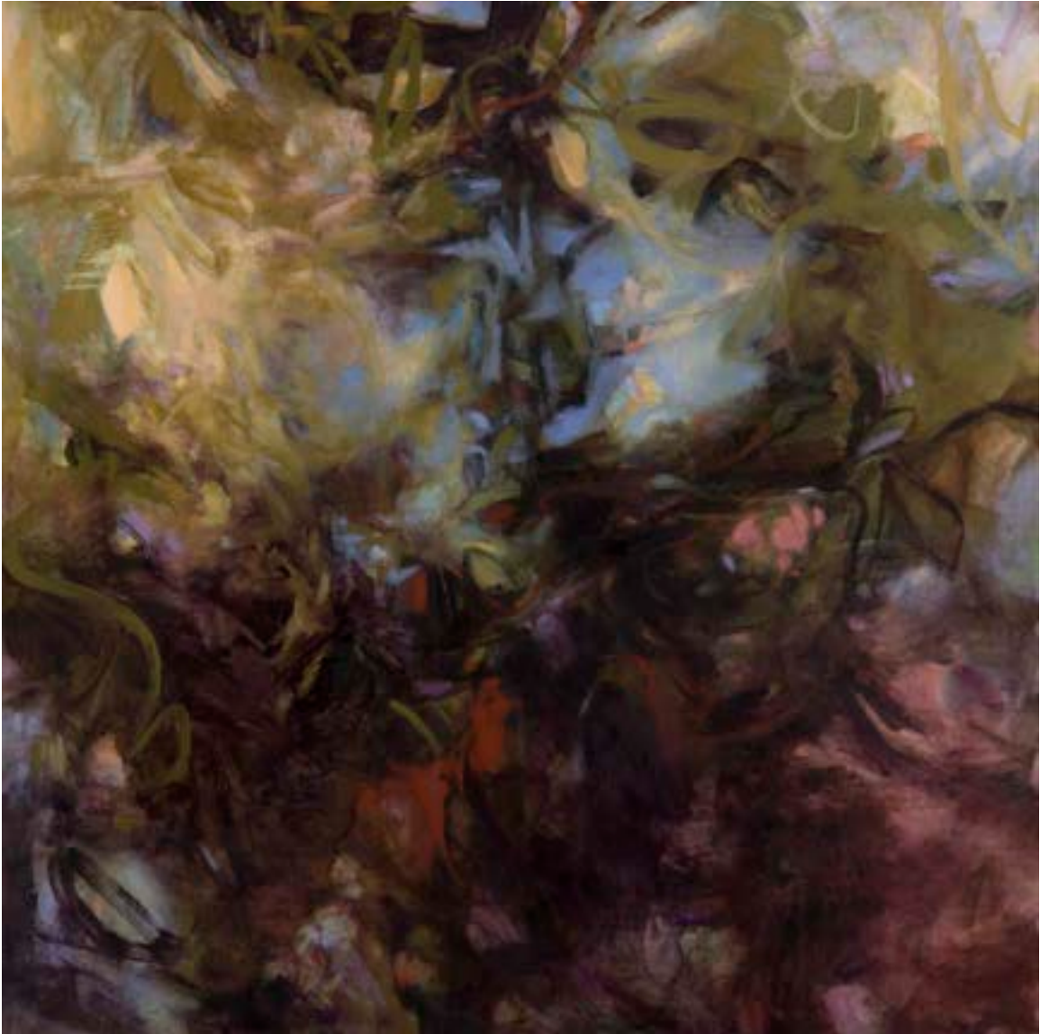
THE DANCE 2021 Oil on canvas 36" x 36"