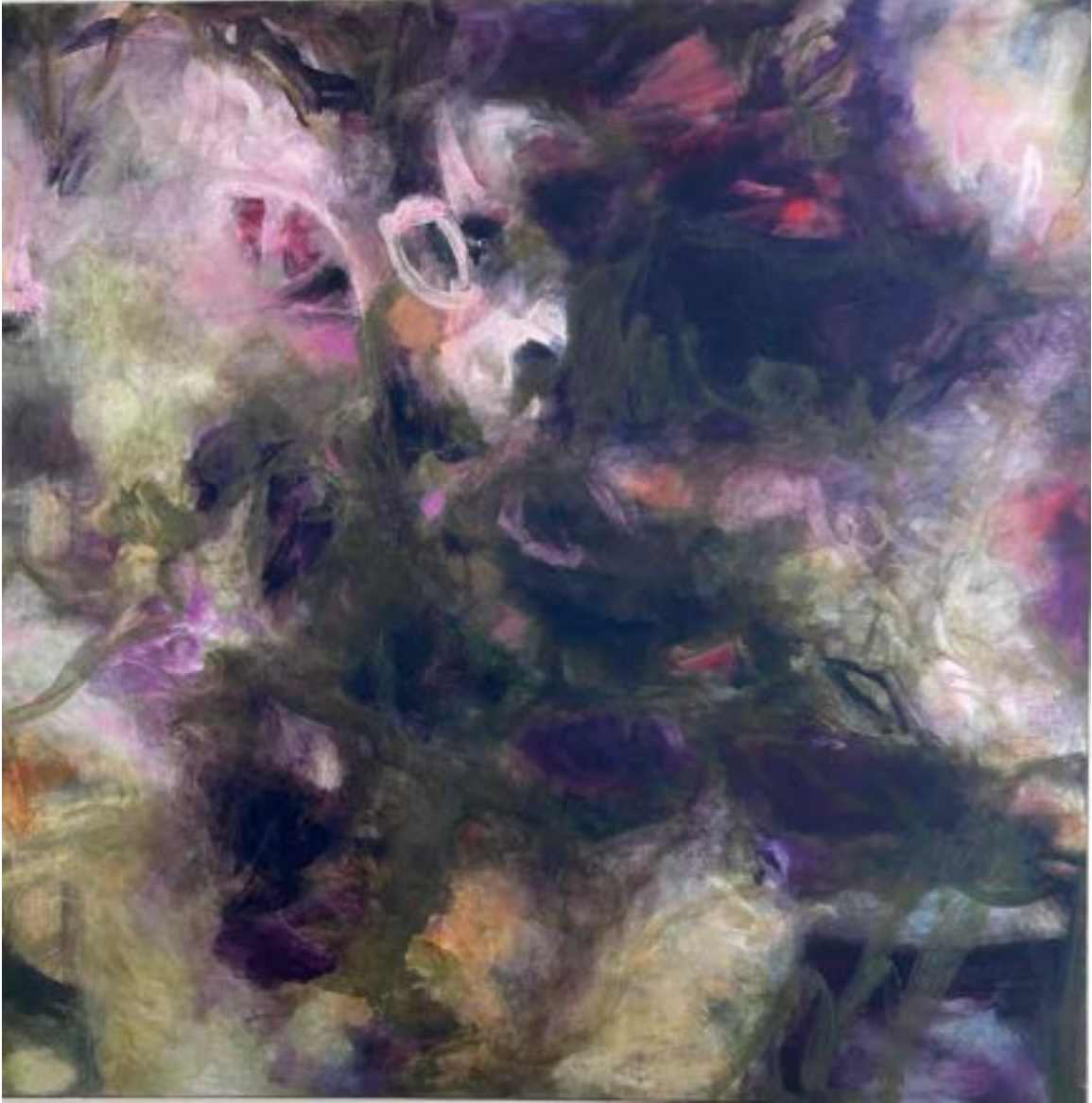
MORNING PROMISE 2026 Oil on canvas 36" x 36"