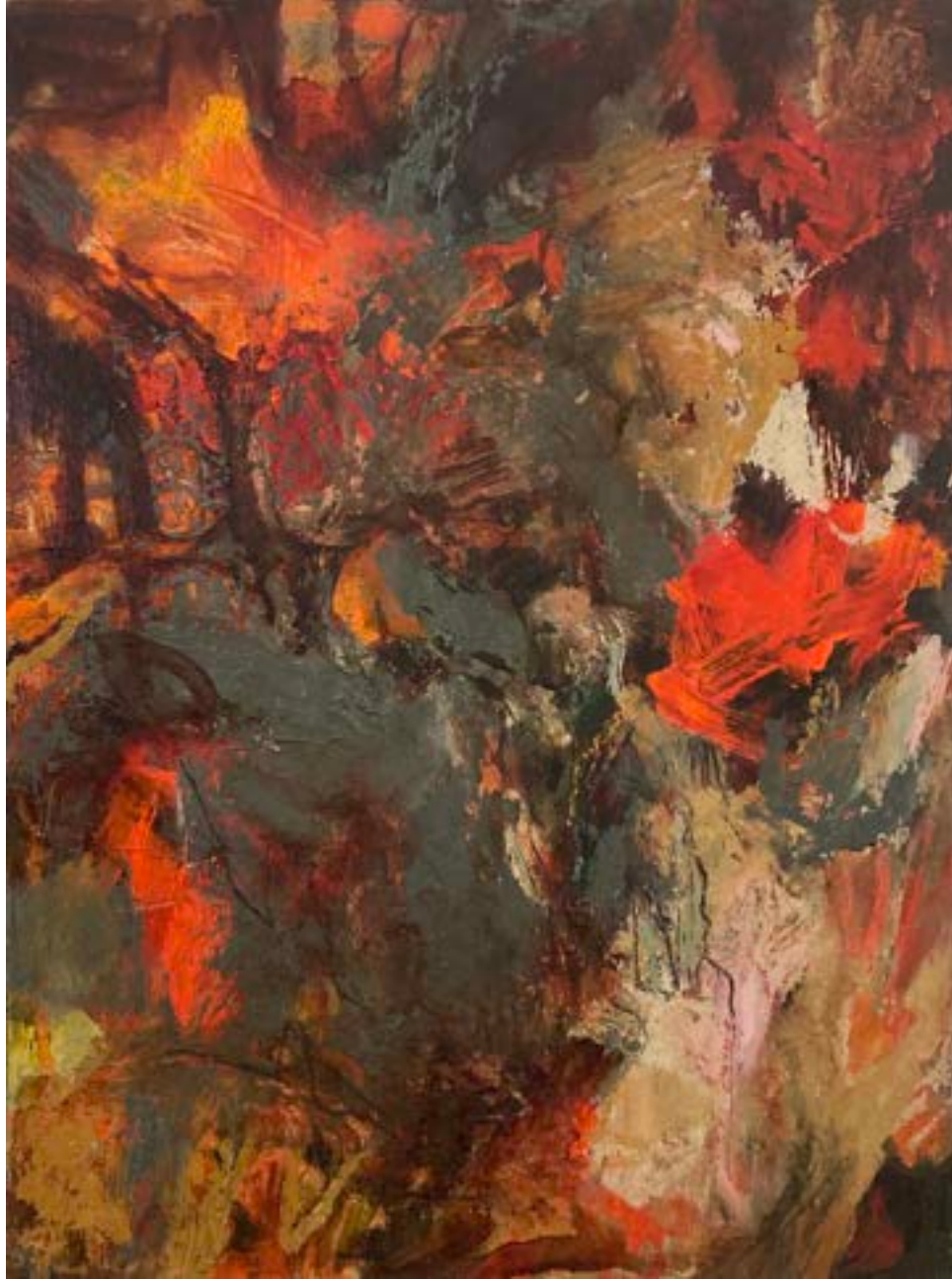
EMBERS OF HOPE 2026 Oil on panel 16" x 12"