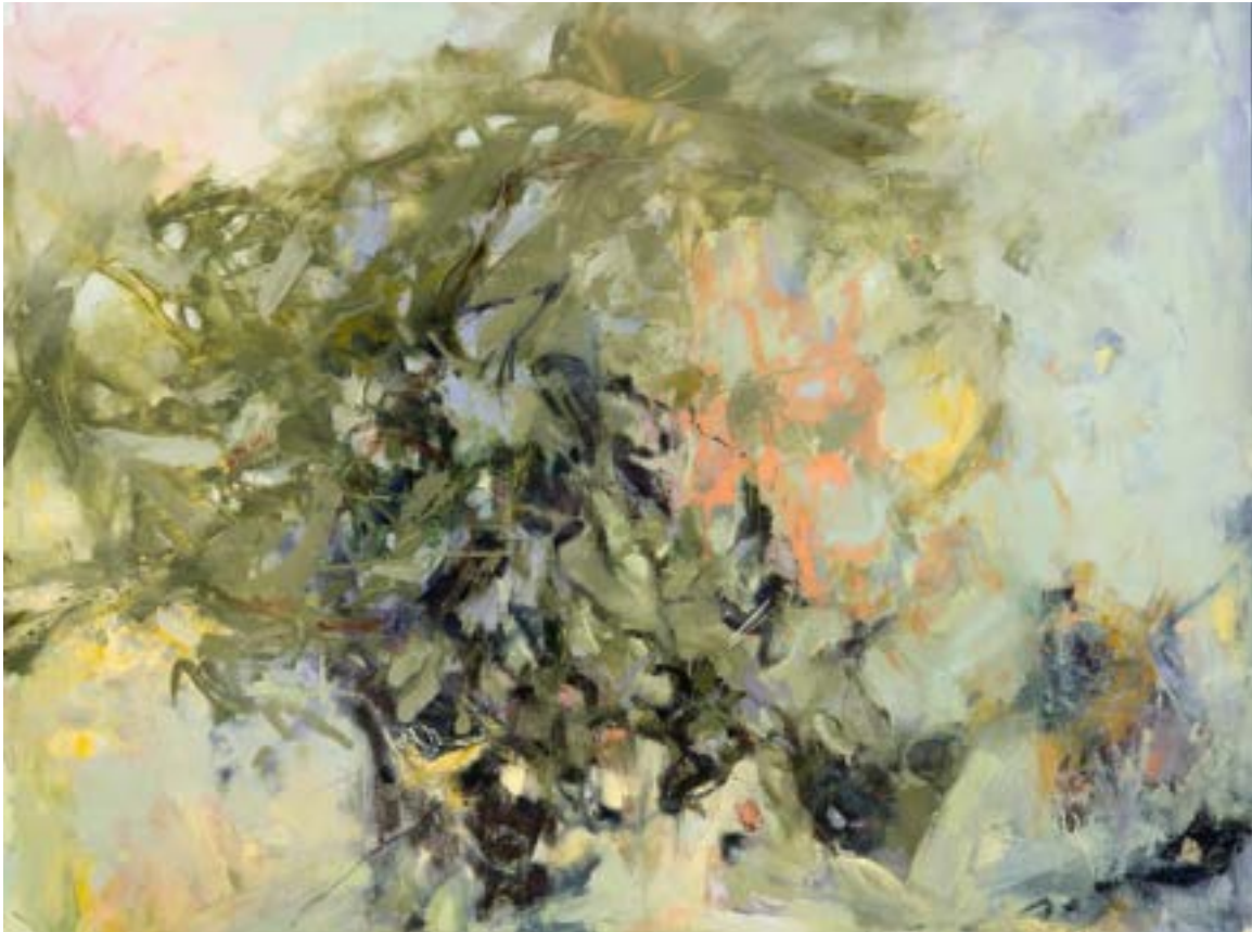
SUMMER WENT BY IN GREEN 2018 Oil on canvas with graphite 36" x 48" x 1.5"