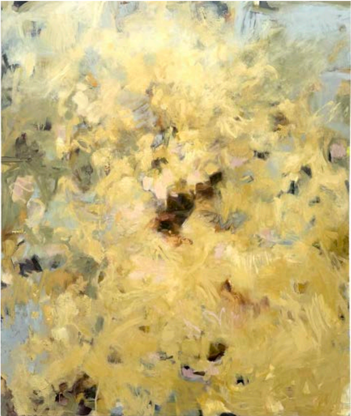
SHARE THE LIGHT 2026 Oil on canvas 72" x 60" x 2"