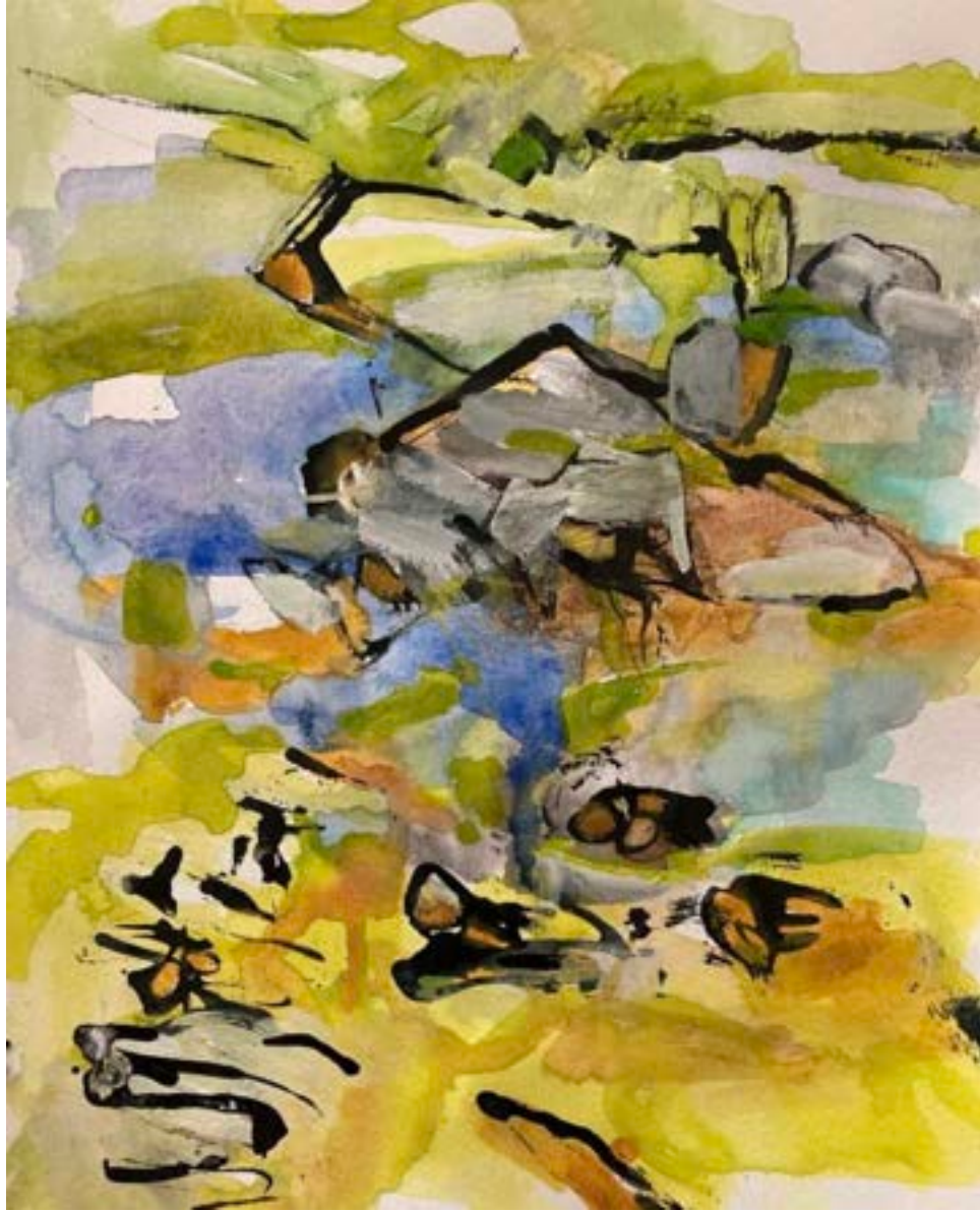
KENDUSKEAG STREAM STUDY 2 2022 Gouache and ink on paper 10" x 7"